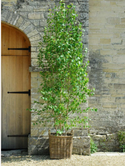
MULTI-STEM BIRCH 3-4M, 4M+