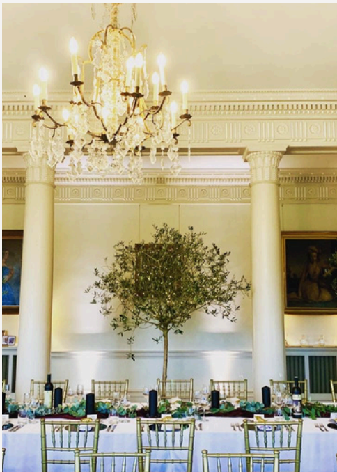
'SHAGGY' OLIVES 2-3M, 3-4M