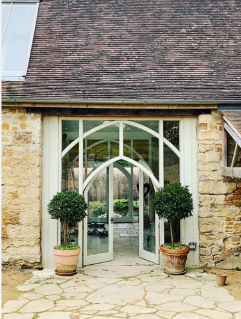
BAY LOLLIPOPS 1.2M, 1.5M