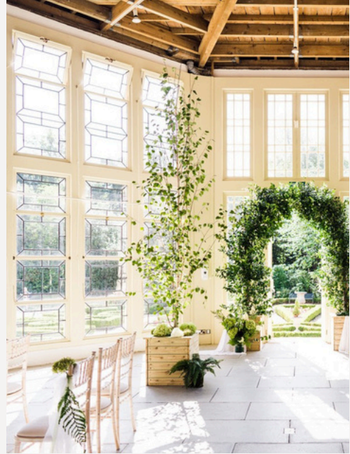
SINGLE-STEM BIRCH 2-3M, 3-4M