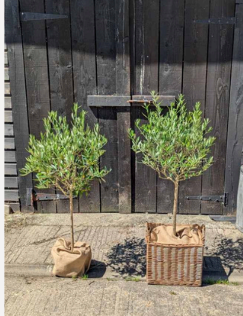
OLIVE LOLLIPOPS 1.2M