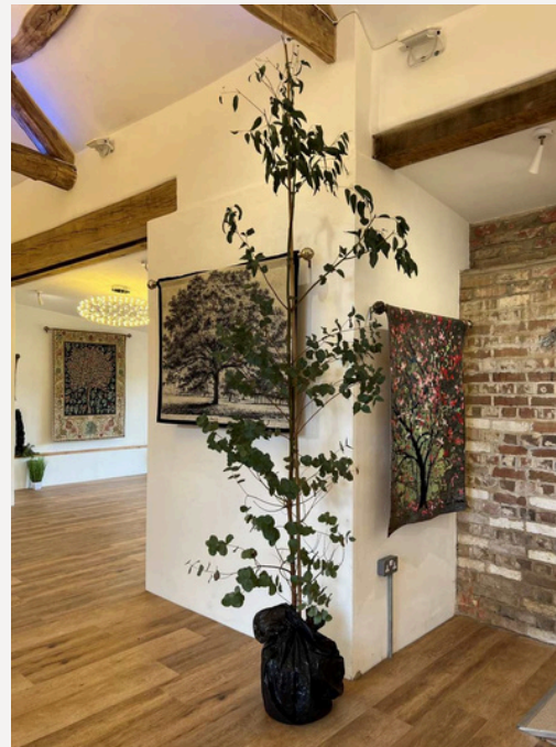
EUCALYPTUS 3-4M, 4+M

TALL TREE PACKAGE: ANY 6 TALL TREES FOR £520