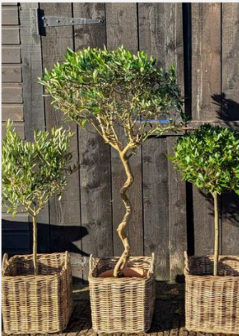
CURLY STEM OLIVE LOLLIPOPS 1.5M

WALKWAY LOLLIPOP PACKAGE: INCLUDES ANY 10 OF OUR LOLLIPOPS FOR £280